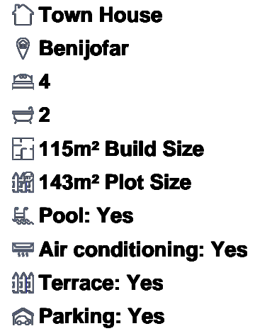
Charming townhouse in Benijófar

Fantastic three-story townhouse in Benijófar, close to all amenities. The property features 4 bedrooms, 2 bathrooms, a terrace, and a private roof terrace with storage, ideal for enjoying the sun all year round. Located in a quiet and highly sought-after urbanization, with a communal swimming pool. Just a few minutes' walk from shops, restaurants, and amenities. The beaches of Guardamar are just a 10-minute drive away.