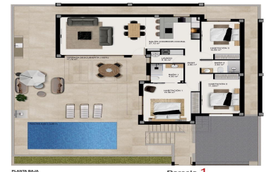
PARCELA 1 Build: 118.00 m 2 Max. Construction Plot Size: 293.00 m 2 Max. Construction Volume: 171.00 m 3

New-build villas for sale in Benijofar, near Ciudad Quesada; A prime location on the Southern Costa Blanca; Discover this exclusive development of just 9 detached villas situated in Benijofar, right next to Ciudad Quesada, in the sought-after area of Atalaya Park. This peaceful residential neighbourhood offers the perfect balance between tranquillity and convenience, with supermarkets, restaurants, cafés and essential amenities just a stone's throw away. Benijofar is a charming Spanish town known for its relaxed lifestyle, whilst nearby Ciudad Quesada offers an international atmosph...(Ask for More Details!)