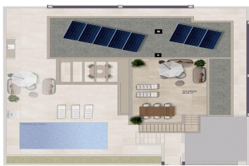
PARCELA 1 Build: 118.00 m 2 Max. Construction Plot Size: 293.00 m 2 Max. Construction Volume: 171.00 m 3